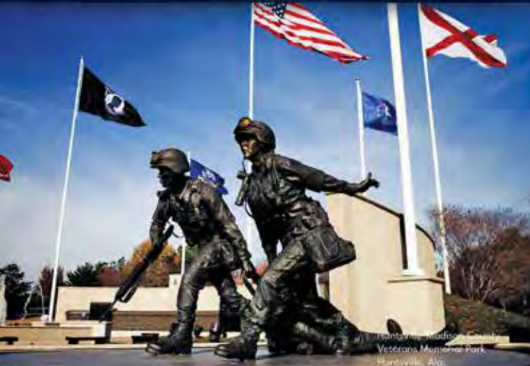
Huntington-Hadley School of Veterans Memorial Park Montevallo, Ala.