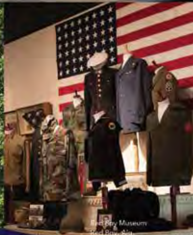
First Army Museum Fowl Bluff, Ala.