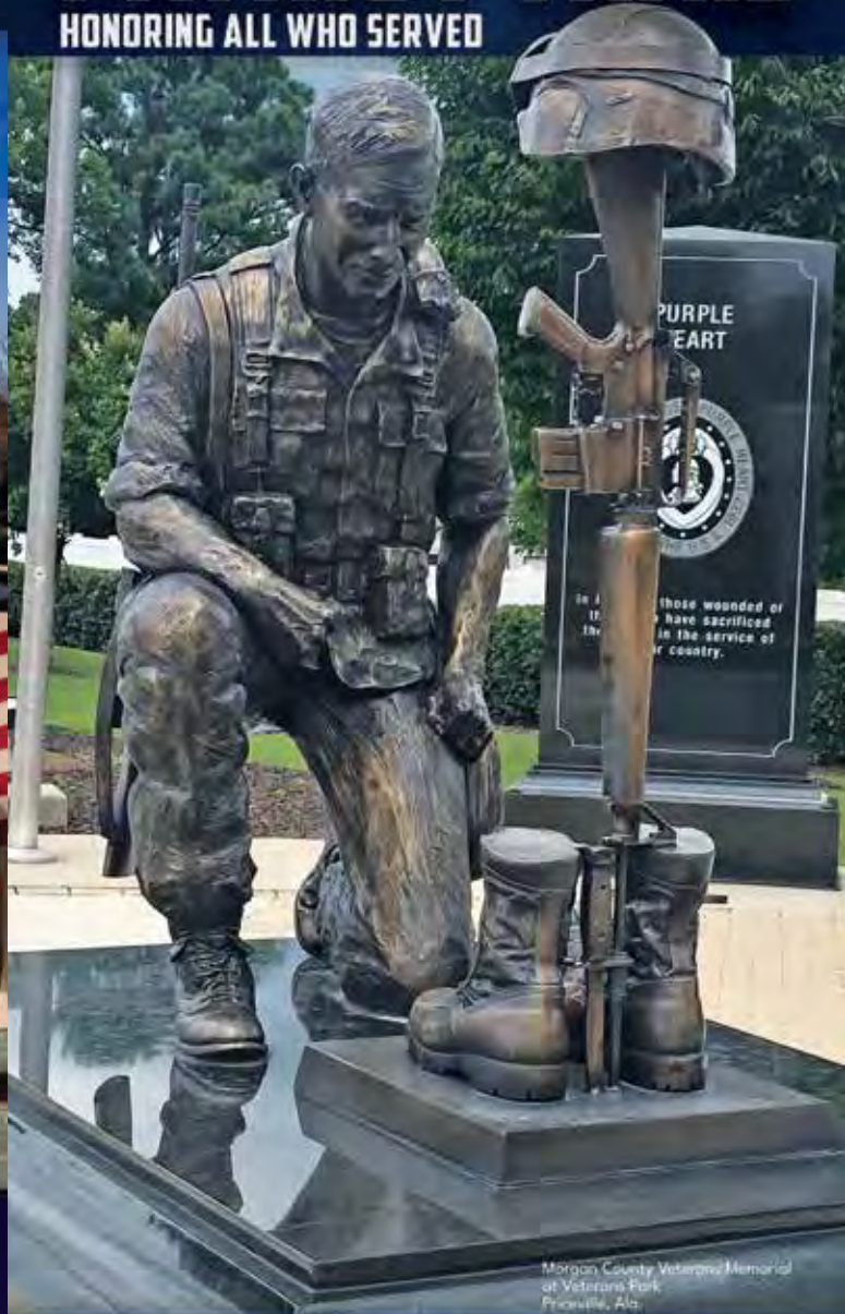
Morgan County Veterans Memorial at Veterans Park Prichard, Ala.

MEMORIAL PARKS, MUSEUMS, ARCHIVES, SPECIAL EVENTS, NOTEWORTHY LOCATIONS, PARADES