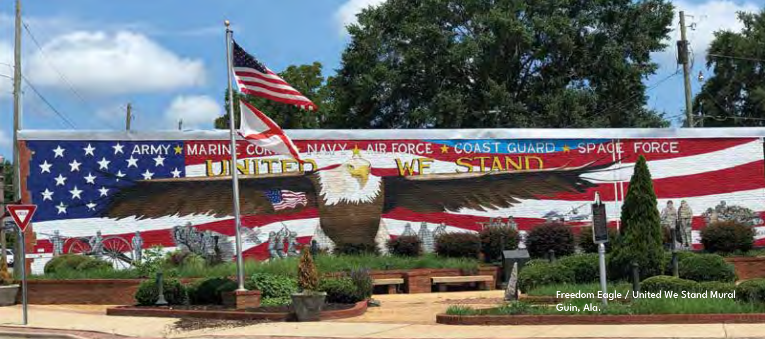
Freedom Eagle / United We Stand Mural Guin, Ala.

dedicated to the World War I heroes from Etowah County who made the ultimate sacrifice for the country.