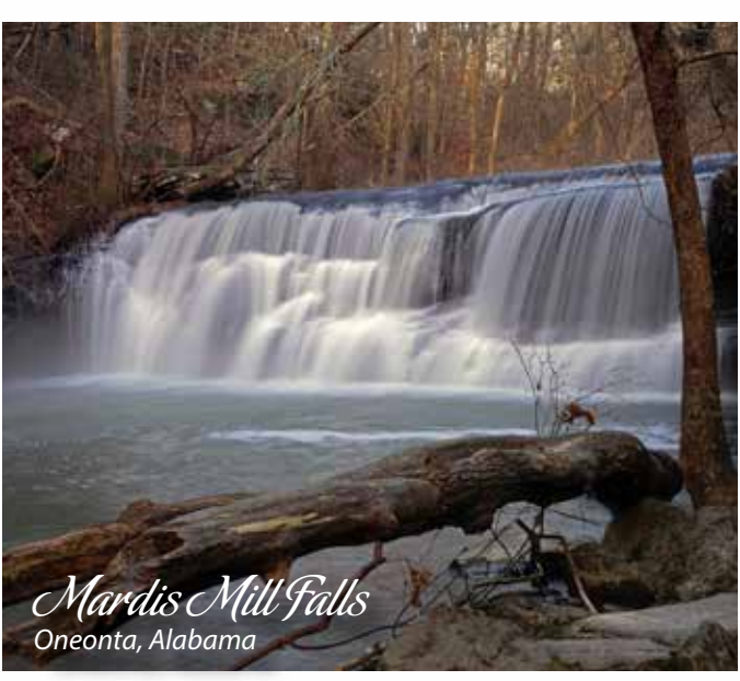
www.BlountOneontaChamber.org Located on Grave's Creek which feeds into The Black Warrior / Locust Fork River. The falls are roughly 35-feet wide and the water drops 16-feet. Also known as Graves Creek Falls.