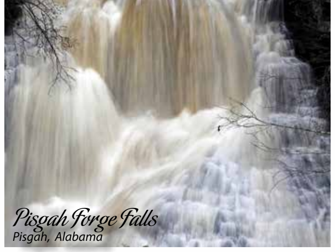
www.JacksonCountyChamber.com This gorge is located within Sand Mountain at Pisgah. At a total of 600 feet spread out over 1.5 miles, the gorge includes two large waterfalls that are each close to 100

Located in Rock Bridge Canyon Equestrian Park, this popular cascading waterfall is located just off Canyon Road. The site was given its name by Jasper and Mary Avery who developed the area for public enjoyment in the 1950's.