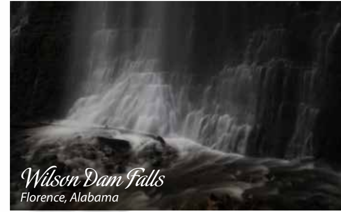
www. {\it VisitFlorence AL. com}

Wilson Dam is on the Tennessee River near Florence. It is the only neoclassical-style dam in the Tennessee Valley Authority system, integrating themes of ancient Roman and Greek architecture into the modern structure. The waterfall is on a high rock wall adjacent to the dam. Small feeder creeks run through the natural area and create this waterfall on an adjacent cliff wall.