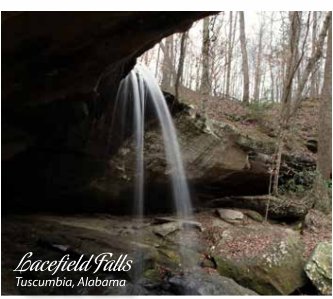
www.ColbertCountyTourism.org Lacefield Falls is located in Cane Creek Canyon Nature Preserve just south of Tuscumbia. A large swath of wild streams, box canyons, waterfalls, rock shelters, and sandstone bluffs encompassing 700 acres remains nearly as pristine and wild as it did centuries ago.

Kinlock Falls is a cascade waterfall that drops 15 feet over a span of 20 feet. Though Kinlock Falls is not a high waterfall, it features a magnificent view, along with being an area that people come to swim. Located along Hubbard Creek in the Bankhead National Forest.