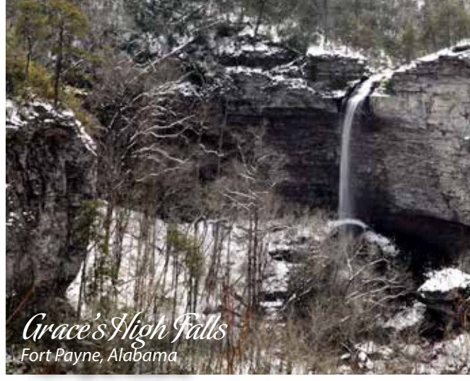
www.DiscoverLookoutMountain.com Located within the 14,000 acres Little River Canyon National Preserve is Grace's High Falls. Though only seasonal, this waterfall is one of Alabama's highest waterfalls. At over 700 feet high, the waterfall features a view you can't find anywhere else. When rainfall is high, a significant amount of smaller creeks and waterfalls can be seen while exploring the area.

Located in northwest Alabama, Rainbow Falls is nestled is a small canyon known as The Dismals, featuring two waterfalls, many various rock formations, and a 3/4-mile trail through the canyon. Dismals Canyon is a National Natural Landmark and is noted as one of the finest examples of ecological and geological features composing our nation's natural history. Pristine wilderness, romantic cabins, secluded campsites, hiking, swimming, canoeing, wildflowers, a country store, and more. Cabins and group tours available year round by reservation.