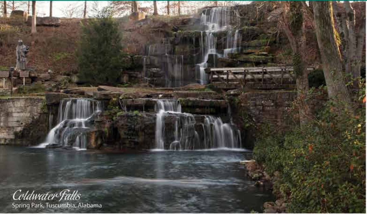
www.ColbertCountyTourism.org Coldwater Falls is a man-made waterfall that is constructed with over 2,000 tons of sandstone. It is located at Spring Park in Tuscumbia and stretches 80 feet wide and is 42 feet tall. Each day over 4.3 million gallons of water flow over the falls.