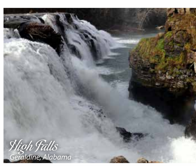
www.JacksonCountyChamber.com High Falls waterfall is considered a hidden treasure in Alabama to many state residents. Located within High Falls County Park, High Falls waterfall is 55 feet high and close to 300 feet wide! In seasons of heavy rains, the entire width of the waterfall is overflowing. The park also features a natural bridge at the bottom of the waterfalls, along with a walking bridge that crosses over the waterfall.