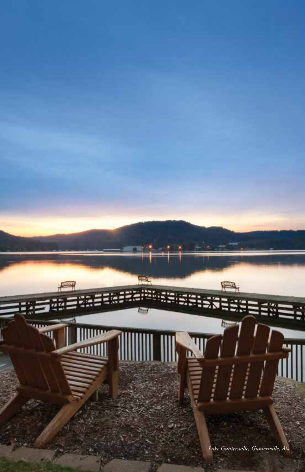
Lake Guntersville, Guntersville, Ala.