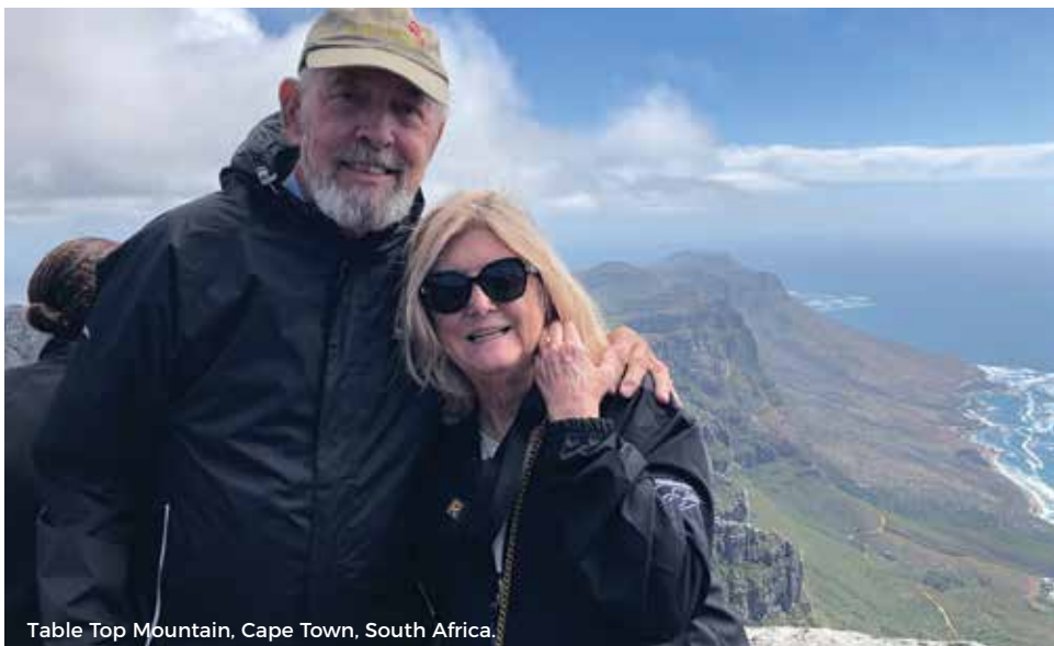
Table Top Mountain, Cape Town, South Africa.