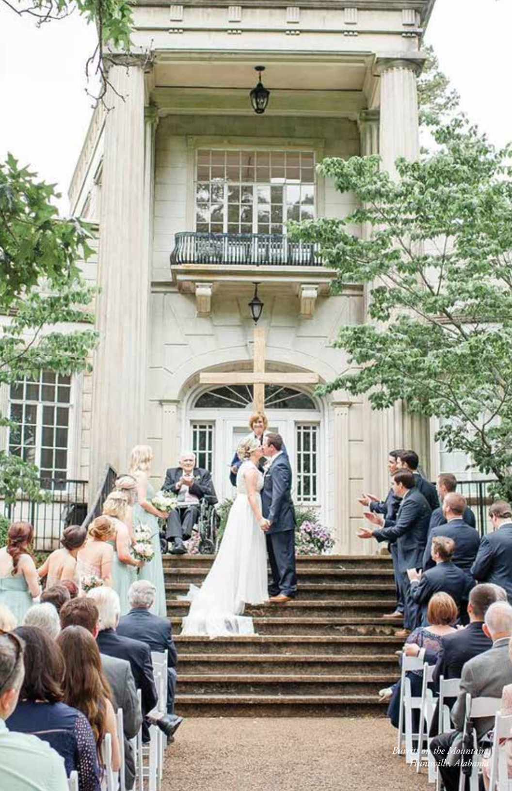
Buritt on the Mountain Huntsville, Alabama