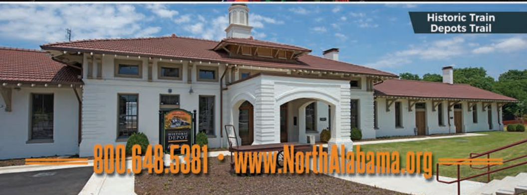
Historic Train Depots Trail