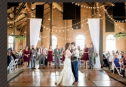
Earlyworks Grand Hall - Huntsville, Ala.