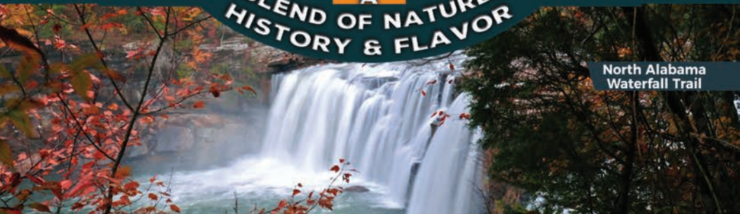
North Alabama Waterfall Trail