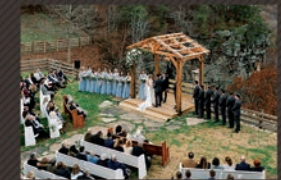
Borns Bluff at High Falls - Albertville, Ala.