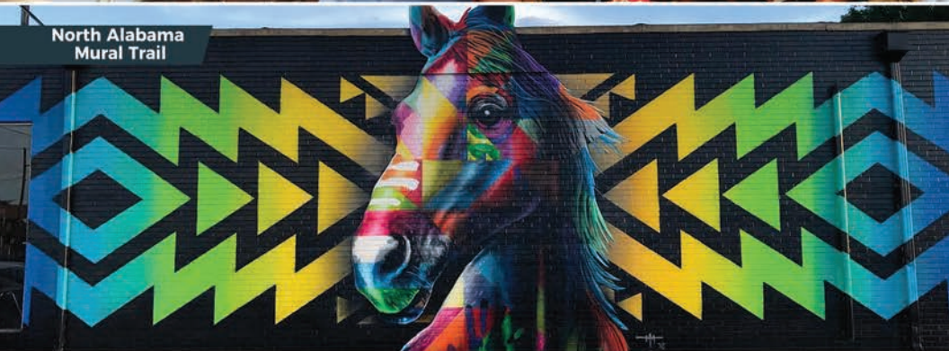
North Alabama Mural Trail