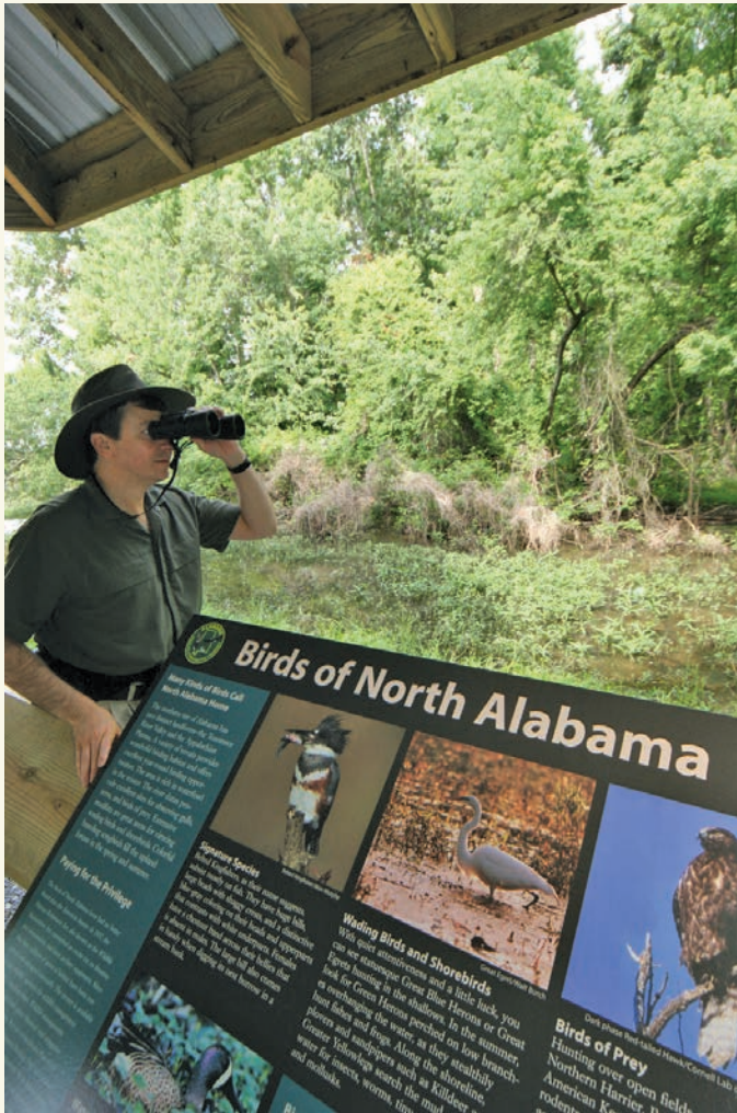
Day Park Kiosk, Decatur, Ala.

Central Loop Site #27 | Madison | Best Seasons: Spring, Fall, Winter GPS: N 34.9025, W 86.5596