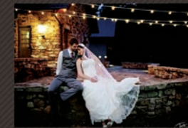
Monte Sano State Park - Huntsville, Ala.