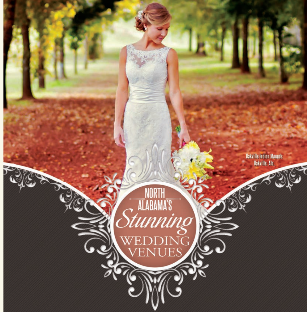
Oakville Indian Mounds Oakville, Ala.