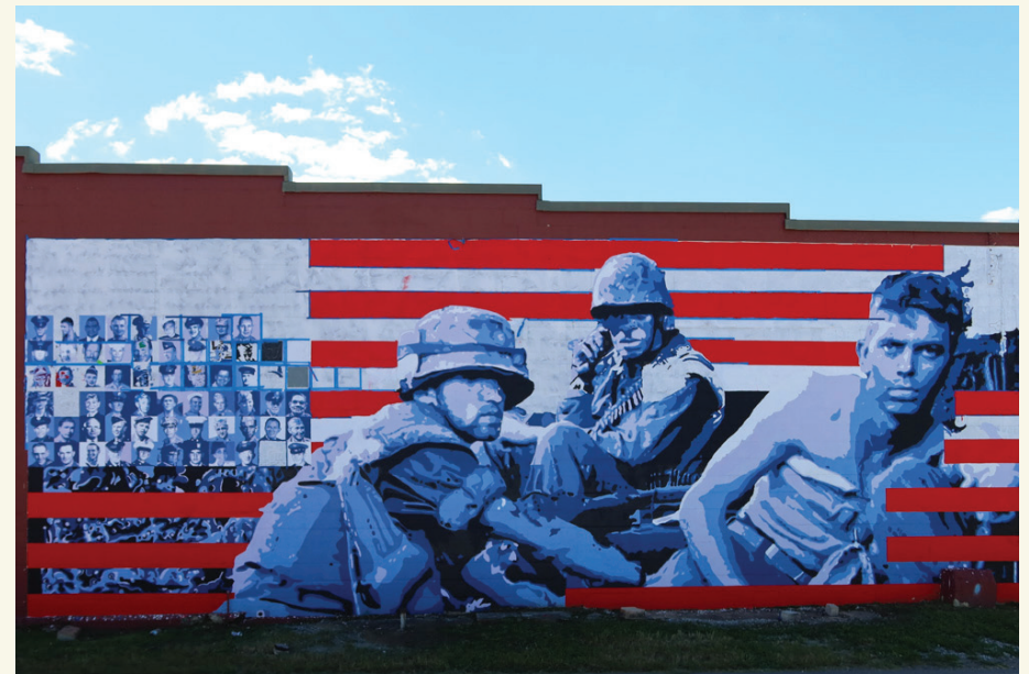
Mural by Athens State University students at Alabama Veterans Museum

People are encouraged to have cameras ready as every mural boasts a completely unique design and creative vision. Be sure to tag #NorthALMurals in all selfies and pictures and upon checking in at 25 sites, Visit North Alabama will award a prize for participating. When visiting a participating mural location, simply check in using the mobile phone's GPS to record each visit.